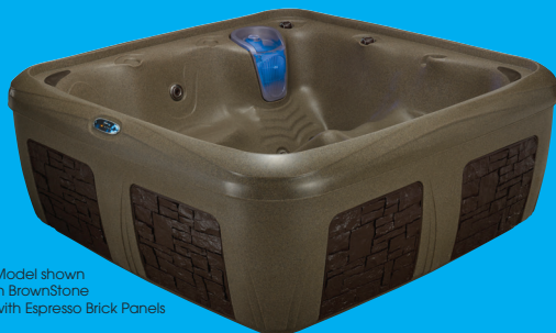
Model shown in BrownStone with Espresso Brick Panels

Seats: 5 – 6 Person with lounge Dimensions: 82" x 82" x 32" / 208 x 208 x 81 cm Jets: 21 Pillows: 3 Capacity: 240 Gallons / 904 Litres Dry Weight: 335 lbs / 152 kg