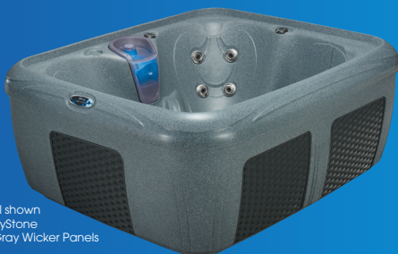
Model shown in GrayStone with Gray Wicker Panels

Seats: 4 – 5 Person bucket & bench Dimensions: 78" x 68" x 32" / 198 x 173 x 81 cm Jets: 16 Pillows: N/A Capacity: 180 Gallons / 681 Litres Dry Weight: 280 lbs / 127 kg