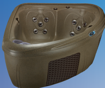
Model shown in BrownStone with Espresso Wicker Panels

Seats: 2 Person bucket seats Dimensions: 78" x 69" x 32" / 198 x 175 x 81 cm Jets: 14 Pillows: N/A Capacity: 170 Gallons / 628 Litres Dry Weight: 270 lbs / 122 kg