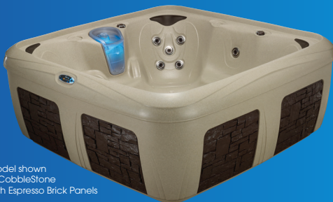
Model shown in CobbleStone with Espresso Brick Panels

Seats: 5 – 6 Person bucket seats Dimensions: 82" x 82" x 32" / 208 x 208 x 81 cm Jets: 23 Pillows: 4 Capacity : 250 Gallons / 950 Litres Dry Weight: 315 lbs / 142 kg