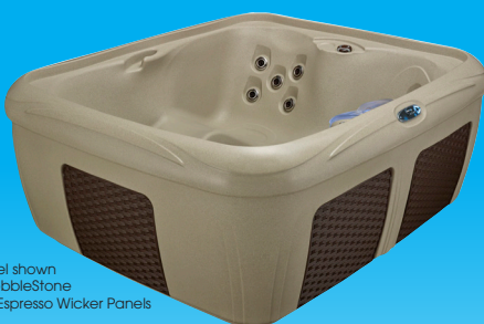
Model shown in CobbleStone with Espresso Wicker Panels

Seats: 3 – 4 Person bucket & lounge Dimensions: 79" x 69" x 32" / 200 x 175 x 81 cm Jets: 16 Pillows: N/A Capacity: 189 Gallons / 716 Litres Dry Weight: 275 lbs / 125 kg